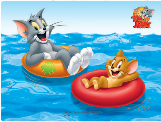
10511 21*28 TOM and JERRY