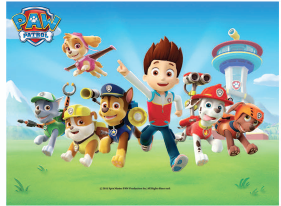
80403 21*28 PAW PATROL

" We can produce any design according to the customer request "