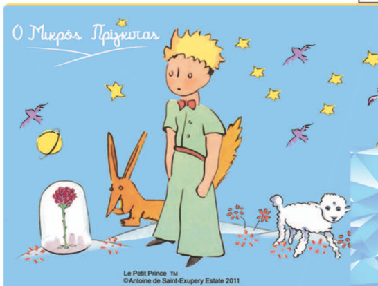
70704 21*28 LE PETIT PRINCE