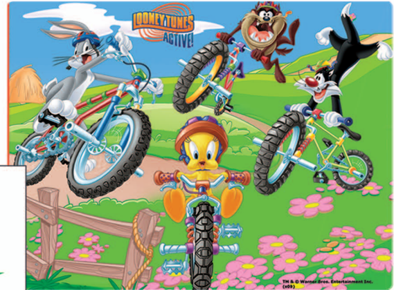
10064 21*28 LOONEY TUNES

Justice League and allrelated characters and elements © DC Comics (s17)