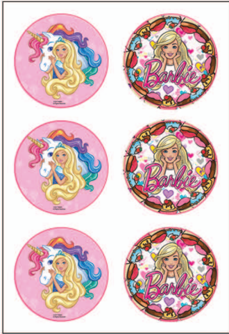
printed muffin 4.5cm Barbie