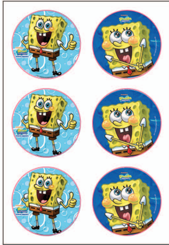
printed muffin 4.5cm Spongebob