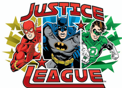
10320 21*28 JUSTICE LEAGUE

Justice League and allrelated characters and elements © DC Comics (s17)