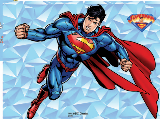
10414 21*28 SUPERMAN