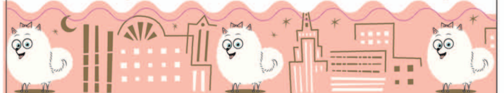
printed ribbons 28*5.4cm pets