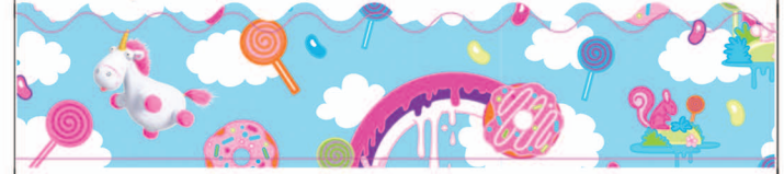
printed ribbons 28*5.4cm minions

" We can produce any design according to the customer request "