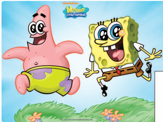
50819 21*28 SPONGEBOB

" We can produce any design according to the customer request "